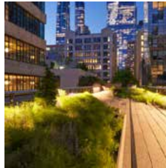
NEW YORK, NY