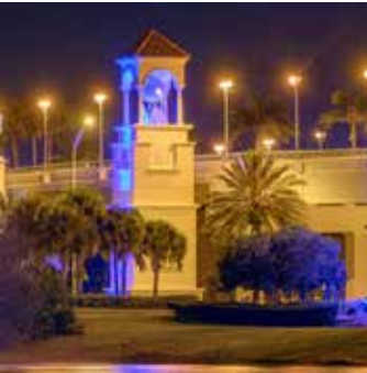
PALM BEACH GARDENS, FL